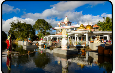
GANGA TALAO TEMPLE